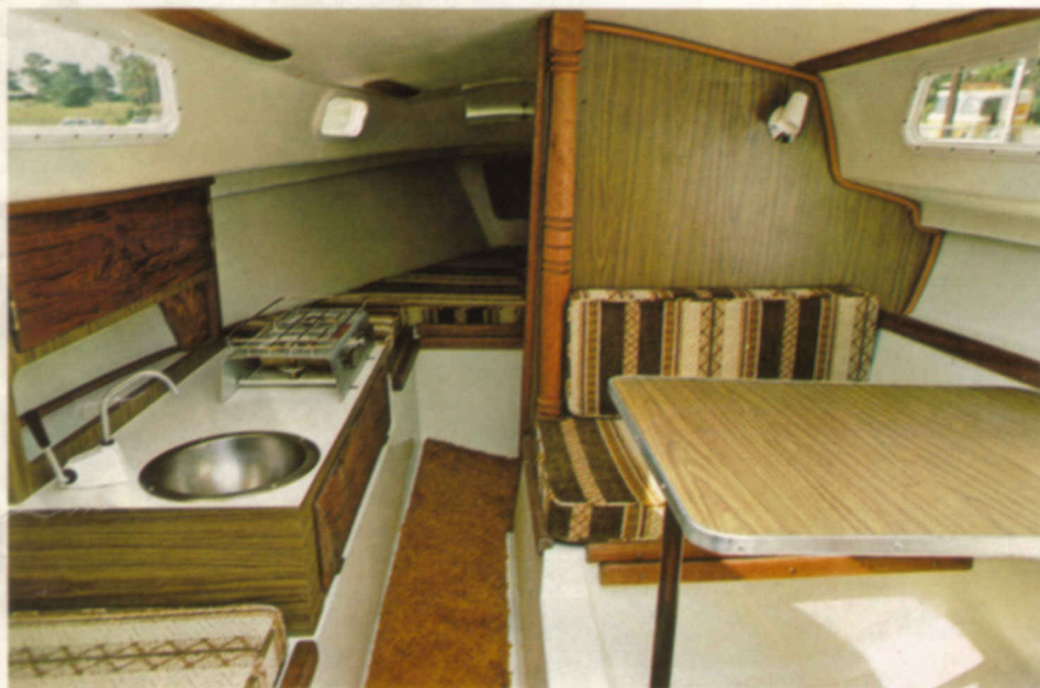
Photographs may illustrate optional equipment, for information and prices contact your dealer

Shoal draft keel, completely self-protecting centerboard, one inch stainless steel centerboard pin, trailerable sloop, self righting and self bailing, full mast head rigging, anodized mast, boom, and spreaders, roller reefing, 5/32 inch stainless steel rigging with 3300 pound capacity, oversized turnbuckles, hull mounted chain plates, hinged mast step, wire halyards with braided dacron tails, cockpit sail locker, with security hasp, cockpit ice chest, kick up rudder with cast aluminum upper half and fiberglass bottom, molded in non-skid deck surface, forward hatch, 4 window ports, sliding hatch drop boards and security hasp, rope locker, stainless steel stem head fitting, all fiberglass inner hull component and headliner, non-skid cabin sole, cabin bulkhead with mast support, all hardware thru-bolted with 18-8 stainless steel fasteners, three step bedding procedure, back up plates built in, hand laid 24 oz. woven roving for tensile strength, hull laminated in one piece for impact resistance, stress distribution, and flexural ability, one year warranty.