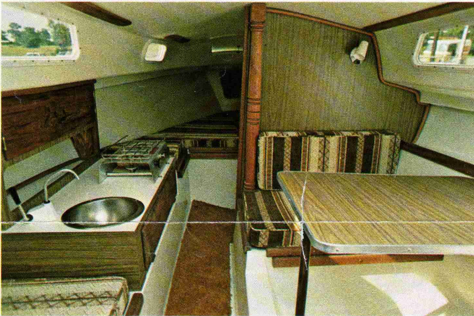
Photographs may illustrate optional equipment, for information and prices contact your dealer

Shoal draft keel, completely self-protecting centerboard, one inch stainless steel centerboard pin, trailerable sloop, self righting and self bailing, full mast head rigging, anodized mast, boom, and spreaders, roller reefing, 5/32 inch stainless steel rigging with 3300 pound capacity, oversized turnbuckles, hull mounted chain plates, hinged mast step, wire halyards with braided dacron tails, cockpit sail locker, with security hasp, cockpit ice chest, kick up rudder with cast aluminum upper half and fiberglass bottom, molded in non-skid deck surface, forward hatch, 4 window ports, sliding hatch drop boards and security hasp, rope locker, stainless steel stem head fitting, all fiberglass inner hull component and headliner, non-skid cabin sole, cabin bulkhead with mast support, all hardware thru-bolted with 18-8 stainless steel fasteners, three step bedding procedure, back up plates built in, hand laid 24 oz. woven roving for tensile strength, hull laminated in one piece for impact resistance, stress distribution, and flexural ability, one year warranty.