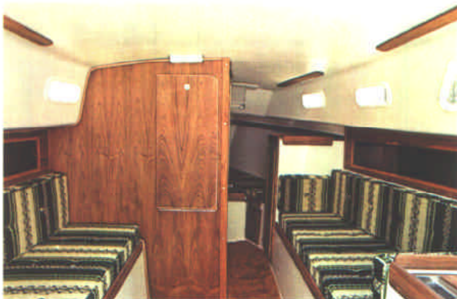
Photographs may illustrate optional equipment. For information and prices, contact your dealer.

The Watkins 27 is available with a shoal draft keel or centerboard. She differs from other designs with her generous beam of 10' and moderately heavy displacement of 7,500 lbs. Emphasis is on interior room, stowage areas and cockpit space. Her interior adds up to more than standard accommodations with a very roomy head compartment, pressured water, shore power and many extras, all standard equipment. She sleeps five in big berths and happily avoids the dinette arrangement, preferring the more practical table that drops from the forward bulkhead. The galley is L-shaped and to the starboard of the companionway. The Watkins 27 is at least a foot wider and 1,000 lbs. heavier than the average 27 yacht, with her rig proportionately larger than average to move her at good speed.